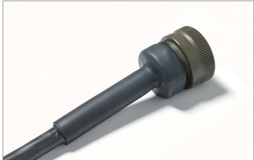
EPS-300 and EPS-400 offer high shrink ratios and protection against humidity.

EPS seals and protect a wide variety of electrical applications like back end connector sealing, connector-to-cable transitions and splices.