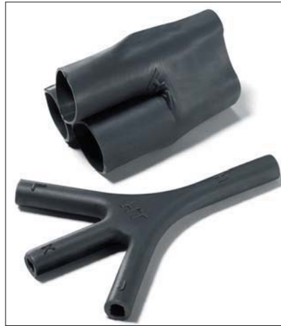
573H532-535 Series supplied / fully recovered.

This style provides strain relief, sealing and mechanical protection on cable harness breakouts or transitions.