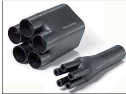
500 Series supplied / fully recovered.

Cable breakout boots are designed for insulating and sealing a cable crotch, or conduit system, and provide excellent resistance to abrasion and weathering.