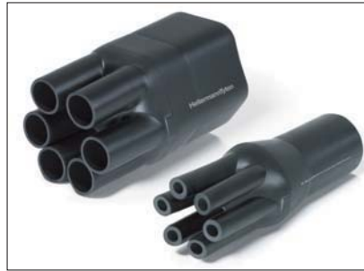
600 Series supplied / fully recovered.

Cable breakout boots are designed for insulating and sealing a cable crotch, or conduit system, and provide excellent resistance to abrasion and weathering.