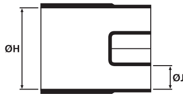
a: Expanded form (supplied)