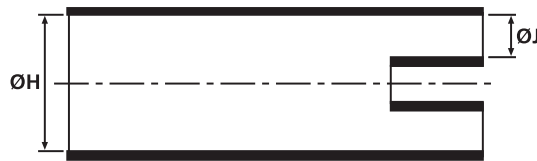
a: Expanded form (supplied)