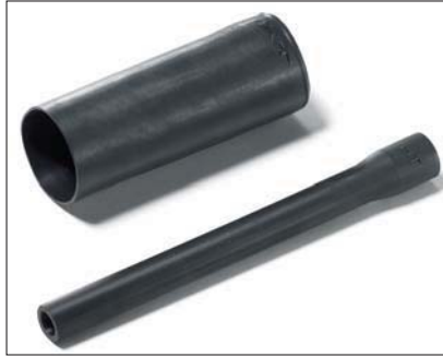
313F322-396 Series supplied / fully recovered.

This boot provides strain relief in applications with partially loaded connectors, resulting in small cable diameters requiring a high shrink ratio.