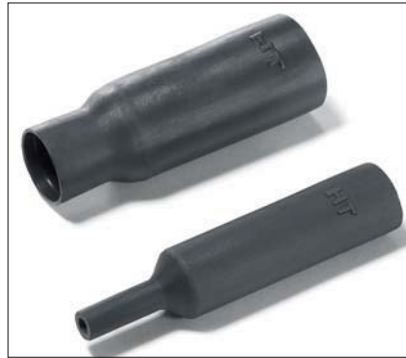
313E445-457 Series supplied / fully recovered.

This part is normally used to build up or shim a cable diameter to facilitate a better fit for components in a cable harness.