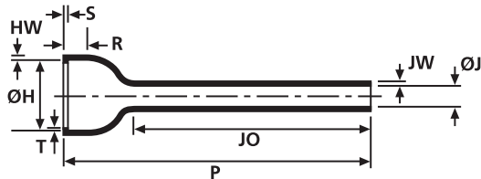
b: Fully recovered form (after heating)