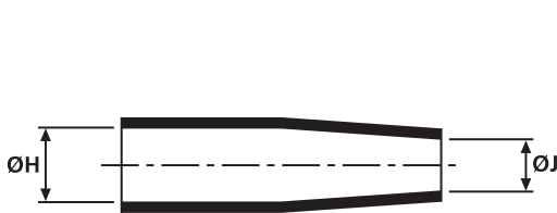
a: Expanded form (supplied)