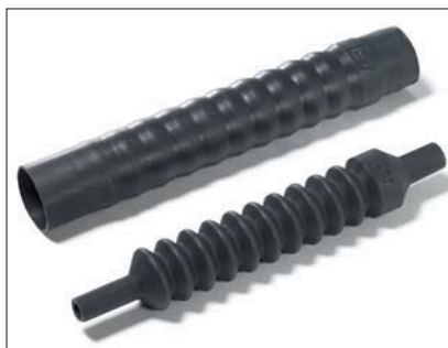
313C722-774 Series supplied / fully recovered.

The convoluted design provides the flexibility to accommodate different cable outlet angles.