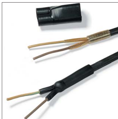
Adhesive tape HMT200A for sealing against humidity.